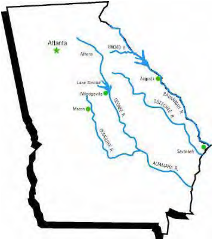
Figure 1. State of Georgia showing the location of GPC's Sinclair Hydroelectric Project and major rivers within the Georgia portion of the historic range for the robust redhorse.